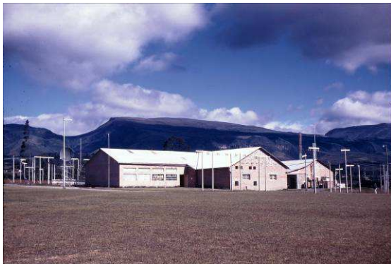
The Transmitter building at HCJB's broadcasting site near Pifo, Ecuador. The property was located at 8,600 feet, high in the Andes mountains.

In the large transmitter building, 10 behemoths of electronic genius pumped out hundreds of thousands of watts of signal power, much of it generated in HCJB Global's own hydroelectric plants even higher in those majestic mountains.