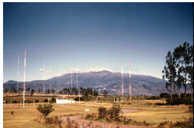
Huge curtain antennas at HCJB's Pifo transmitter site high in the Andes mountains sent Christian programming around the world via shortwave.

Hidden away in the roof of this fascinating building was a switcher unit, or to be more precise, dozens of switchers. These connected the appropriate transmitter to its scheduled antenna to beam the Christian message from Pifo in the morning to missionaries in the Brazilian Amazon or to German settlers in Paraguay and Argentina. In the afternoon they helped send programs to eager listeners in Europe, the Middle East and Africa; in the evening to enthusiastic listeners in the Americas and the Caribbean and in the wee hours of the morning to others in East Asia and the South Pacific.